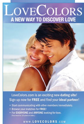
Love Colors Dating Site

“Auras aren’t real, its new-age ‘woo-woo!’”